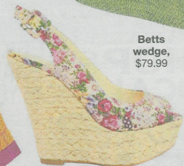
Betts wedge, $79.99