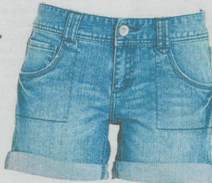
Just Jeans shorts, $49.95