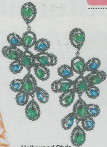
Hollywood Style earrings, $129