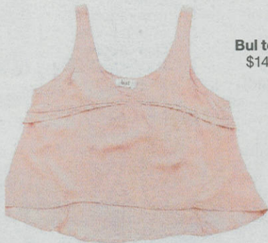
Bul top, $140