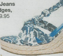
Just Jeans wedges, $49.95