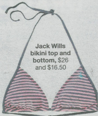
Jack Wills bikini top and bottom, $26 and $16.50