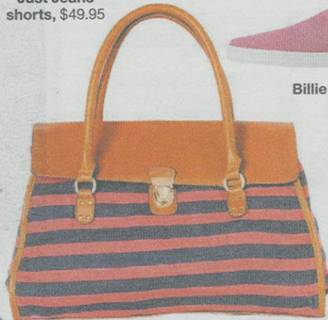
Dotti tote, $49.95