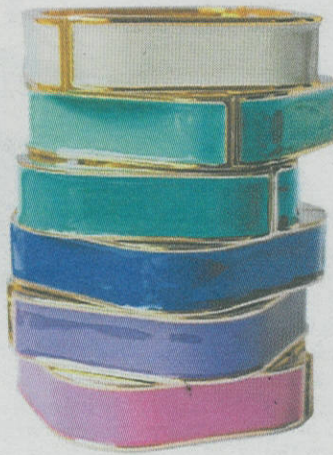
Bespoke bracelets, $33 each