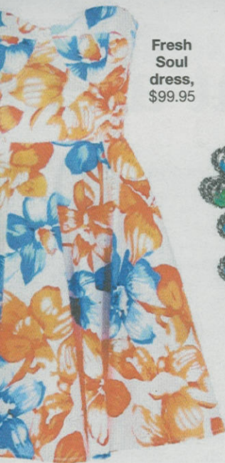
Fresh Soul dress, $99.95